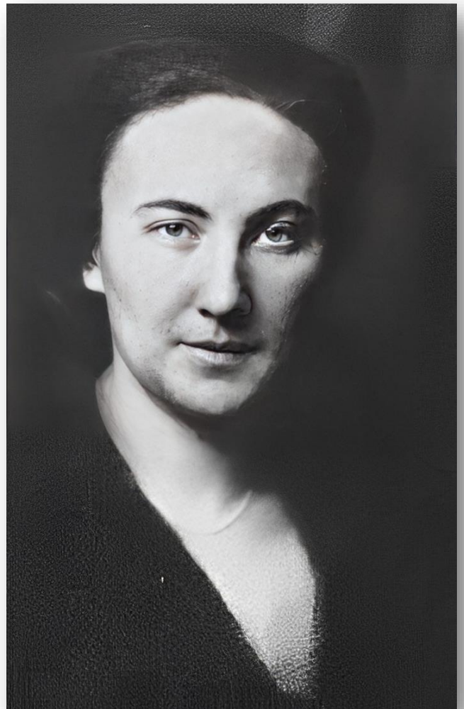
CHARLOTTE BUHLER (1893-1974)

The investigation contained in Kleinkindertests: Entwicklungs-tests had begun two years before with the support of the City of Vienna, -which provided access to the children evaluated-, and also from the Rockefeller Foundation, that became "sponsor" of the work. This support allowed the hiring of numerous collaborators who did a huge job in relatively little time. The first results on the topic for three years old were published in 1928-1930, and in 1933 the age ranges of 4-6 years were added. The complete results are here considered and presented.