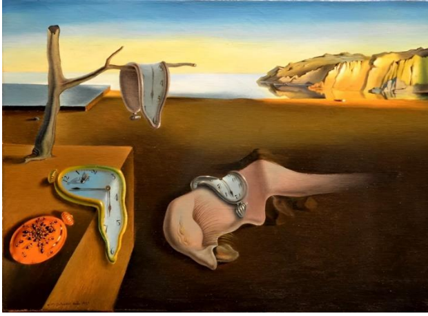
La persistencia de la memoria (Salvador Dalí, 1931).

Indeed, even if ‘irreversibility of time’ is accepted as an axiom in theories on human development, this claim may be insufficient or inaccurate, depending on the system and scale under consideration. Psychoanalysis, for example, has shown that, with regard to the effectiveness of certain representations for the production of symptoms, timelessness must be admitted for the psychic unconscious system. Something comparable happens with retroaction, afterwardsness or après-coup (Arlow, 1986).