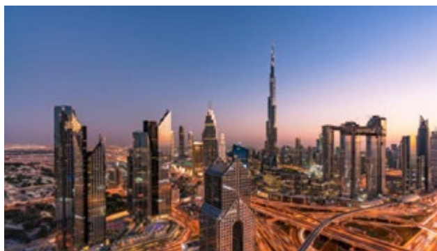
Busy downtown Dubai

and lobbied the Australian Government for Medicare rebates from afar, subsequently working as Middle School Counselor at the Dubai American Academy.