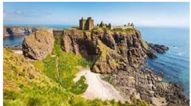
Dunnottar Castle, Stonehaven (I lived up the hill)