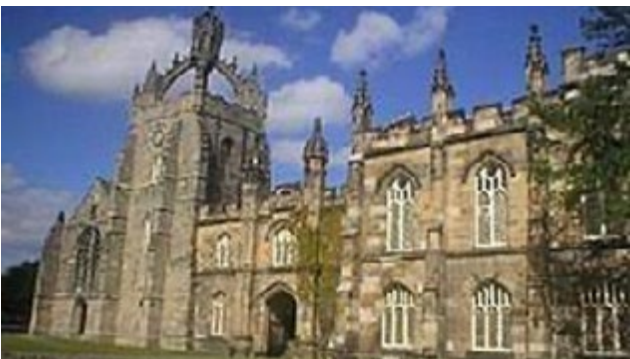
King's College (1520), Old Aberdeen

This motivated my desire to study clinical psychology, which allowed more direct engagement with the complexities of human nature. I was fortunate enough to be one of four students offered a place on a BPS-approved MSc (Clinical Psychology) at Aberdeen University and headed up there for two years - from a position in London as ‘front-of-house’ at a publishing company in Baker Street (of Sherlock