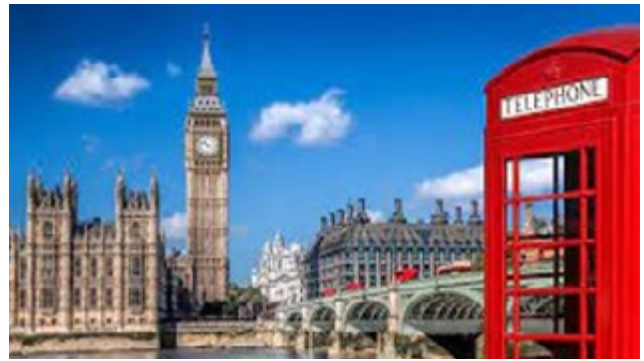
Big Ben and Houses of Parliament

group of us in the profession initially in 2004 – and fully in 2006 - under the ‘Better Access to Mental Health Service Delivery’ initiative in Australia.