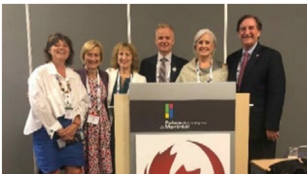
ICAP Montreal (2018)

clinical psychologist in our regional and rural community. I have recently been appointed by the Minister for Health as NSW Practitioner Member of the Psychology Board of Australia (2022-2025) - and look forward to this new national policy role over the next three years.