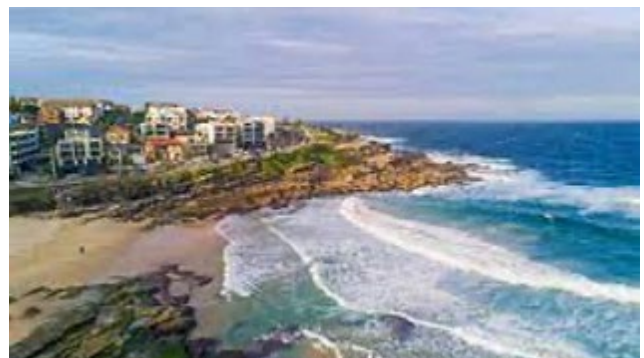
Maroubra Beach - favorite location

When we moved after seven years to regional NSW, I took up the post of Director, Psychological Services Centre at Charles Sturt University. In this position, it became clear that people in rural Australia were also unable to afford fees for mental health treatment, so the need for public funding was again imperative.