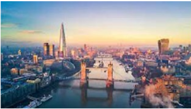
The Thames and Tower Bridge

PhD at University College, London to complement my clinical work at the hospital in the treatment of agoraphobia. Again, the UC requirement for purely quantitative measures (averaged across greatly varying individuals), group comparisons and large control groups - when it was clear that evidence-based CBT interventions and an integrative psychotherapy model was working - resulted in me writing a book instead - “Agoraphobia: The Fear of Panic” , Fontana, UK (two editions of the book sold out!).