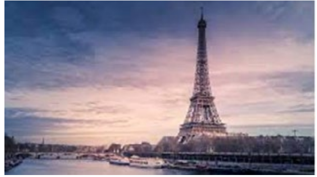
The Eiffel Tower (near where I lived)

Holmes fame). This interspersing of travel and adventure whilst growing professionally, was of great benefit - particularly in later clinical work, where some ‘life experience’ is crucial in understanding our patients’ frequently complex dilemmas and life situations.