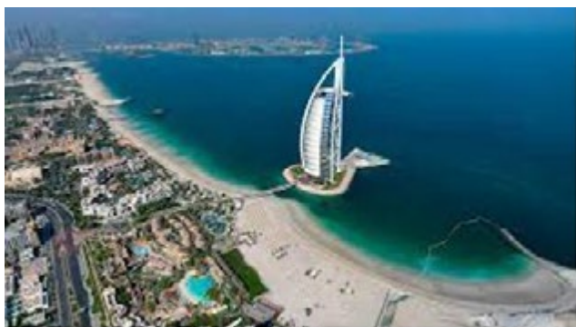
The Burj Al Arab at Um Suqueim

Our research team (with me as 'Chief Investigator') established the "Clinical Psychology in Rural General Practice Project", enabling service delivery under an Australian Government-funded research trial comparing treatment by GPs/family physicians (mostly involving prescription medication) with 'collaborative co-located care' between GPs and clinical psychology registrars. The positive findings, indicating significantly greater levels of improvement with collaborative psychological care, formed one of the key platforms for lobbying the government for Medicare rebates.