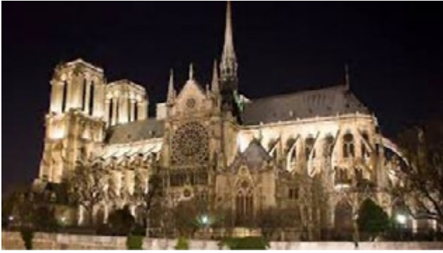
Notre Dame (as I knew it when a student in Paris)

Returning to the University of Melbourne as a research assistant in psycholinguistics and tutor in the Psychology Department, I completed my Honors research thesis on art perception – then headed to Paris to pursue this interest.