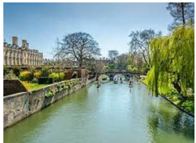
The River Cam