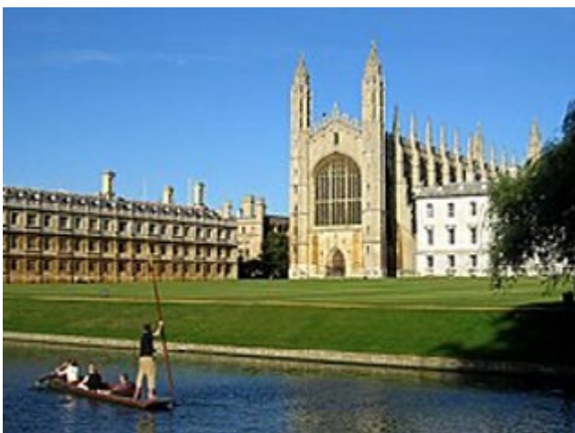
'The Backs' at Cambridge

My first professional job was at the Applied Psychology Unit in Cambridge, UK as research assistant to two greats of experimental psychology: Professors Donald and Margaret Broadbent - exploring aspects of memory ( https://link.springer.com/article/10.1007/BF00308459 ).