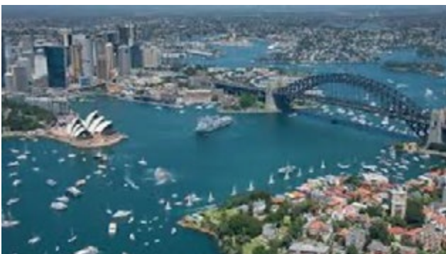
Sydney from the air as you fly in

Returning to Australia, I took up a position as Assistant Director & Head of Clinical Services at a private Psychotherapy Foundation: the Cairnmillar Institute in Melbourne (a private Psychotherapy Foundation), where it became apparent that the lack of public funding for mental health services created huge inequities in service delivery. For those unable to afford services the combined stress of economic/financial deprivation and an inability to access psychological help, became the basis for ongoing advocacy for the integration of mental health services into primary care (enabling early intervention) and inclusion under Medicare funding (facilitating affordability and equitable access). This was eventually achieved by a