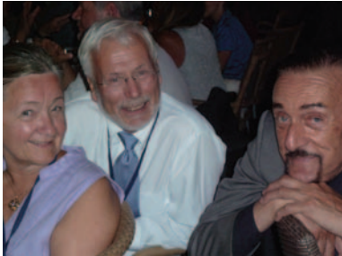
Colleagues enjoying dinner and one another