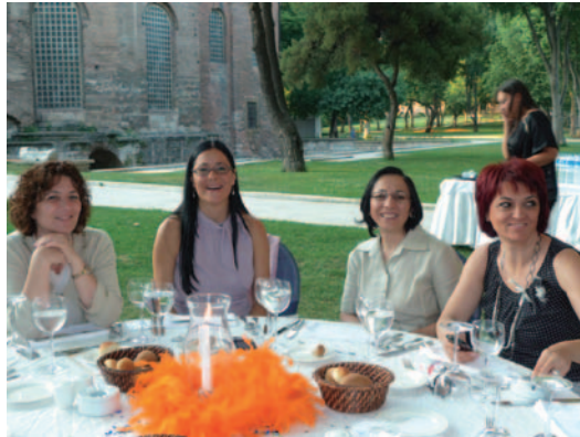
Our lovely Turkish hosts