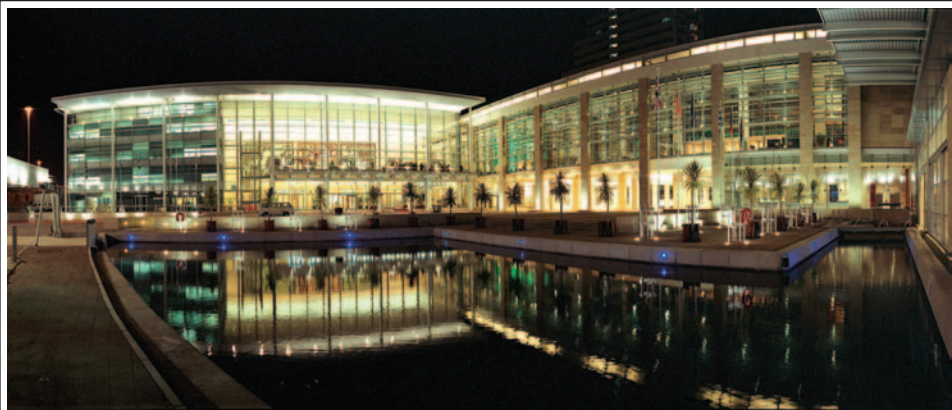
Cape Town International Convention Centre