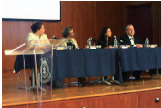
UN DPI/MGO Communications workshop panel on fundraising

The morning panel focused on sources of funding, approaches to writing grant proposals, resources available to NGOs, and how to develop relationships with donors. The afternoon workshop focused on ways to apply strategies presented in the morning session: designing a successful grant, identifying needs, developing objectives, designing a plan of operation, budgeting, and implementing a program evaluation.