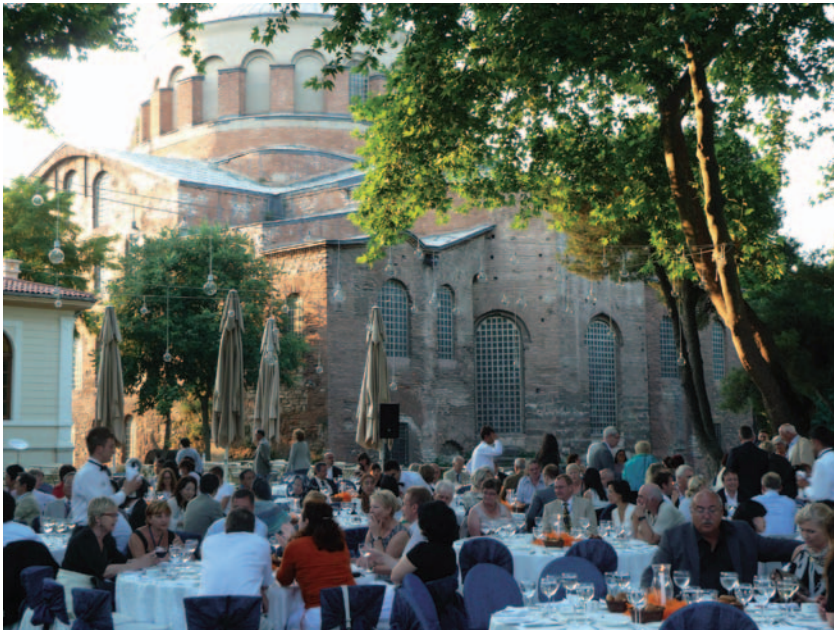
Gala Dinner and environs