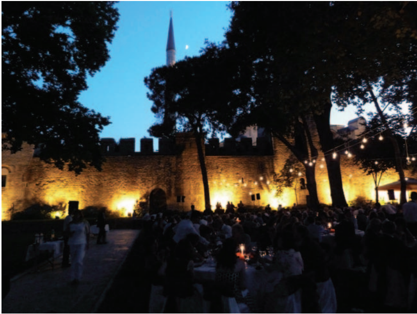
Gala Dinner by Night