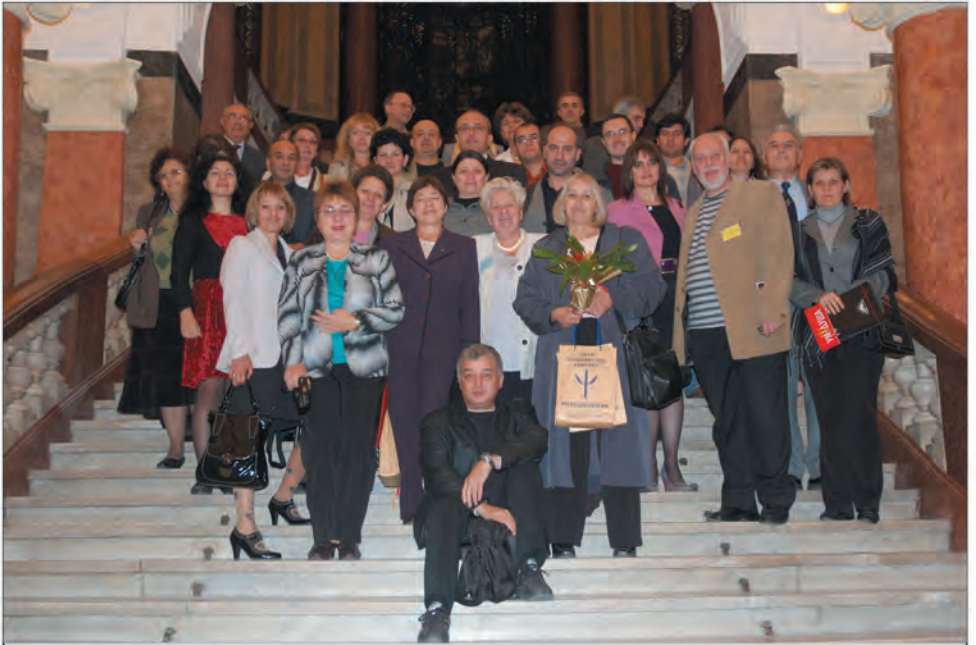
a photo made after the discussion on RCP2009 program at the National Congress of Psychology - these are the members of local organizing group and some of the colleagues from the region.

The South-East European Regional Conference of Psychology - 2009 (SEERCP2009) "Southeastern Europe Looking Ahead: Paradigms, Schools, Needs and Achievements of Psychology in the Region" will allow us to demonstrate the achievements and enhance the capacity-building collaboration of the psychologists in the region and the world. SEERCP2009 will help psychologists representing the countries in the region to share and increase their professional knowledge of what is going on in their countries, to learn about the paradigms, schools, needs and achievements of psychologists across the region and other parts of the world.