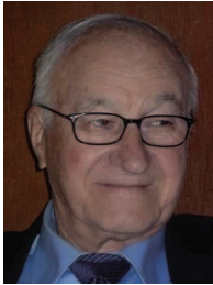
Professor Albert Bandura

Social Learning Theory (1977), Social Foundations of Thought and Action: A Social Cognitive Theory (1986), and Self-efficacy: The Exercise of Control (1997).