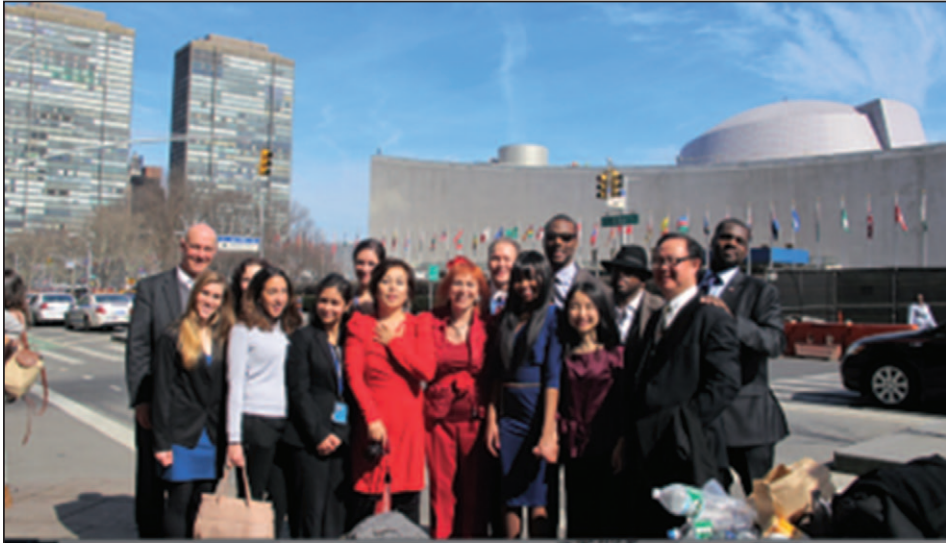
(The following two photos can be next to each other with the caption© Caption: CSW 2014 event participants, including speakers, musical performers, and representatives from First Lady of Africa offices