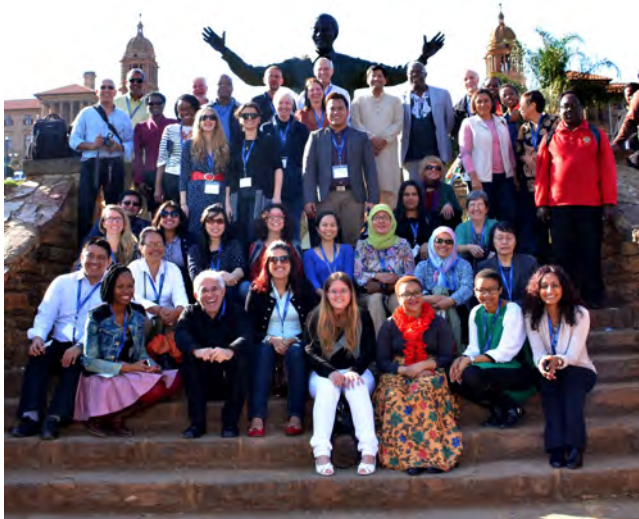
Participants in the 14 th annual symposium of the Committee for the Psychological Study of Peace (CPSP)