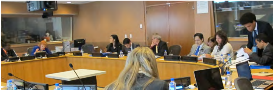
A meeting of the “Friends of Mental Health and Well-being”