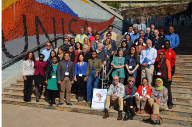
Participants in the 14 th annual symposium of the Committee for the Psychological Study of Peace (CPSP)

leadership and clear standards of conduct for all participating associations and members. This important step is just one of the public policy positions that resulted from the 2015 CPSP symposium in South Africa. Moreover, the findings from this conference will be shared and disseminated through the Springer Peace Psychology Book Series in 2016. Stayed tuned for future information about this publication!